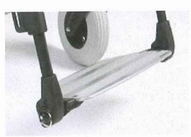
Continuous footrest with a lock