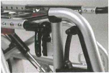
Footrest with a ratchet joint